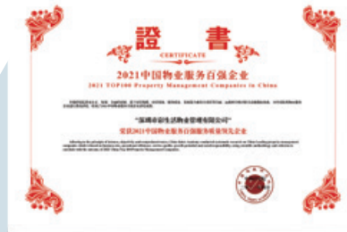
10. "2021 Top 100 Leading Property Management Companies in terms of Service Quality in China" by China Index Academy in April 2021