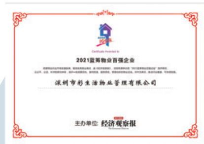
17. “2021 Top 100 Blue Chip Property Management Companies” by The Economic Observer in June 2021