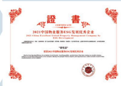
12. "2021 China Excellent Listed Property Management Company by ESG Development" by China Index Academy in May 2021