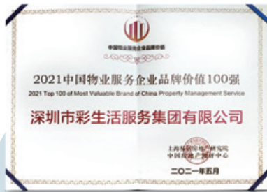
11. "2021 Top 100 of Most Valuable Brand of China Property Management Service" by Shanghai E-House Real Estate Institute and China Real Estate Appraisal Center in May 2021