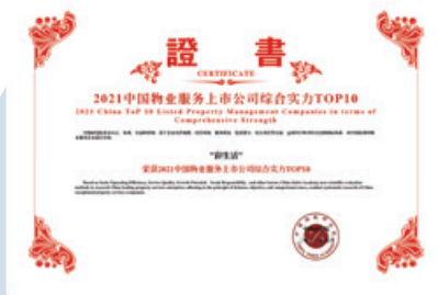
13. "2021 China Top 10 Listed Property Management Companies in terms of Comprehensive Strength" by China Index Academy in May 2021