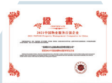
19. "2021 China Leading High-end Property Management Companies" by China Index Academy in April 2021