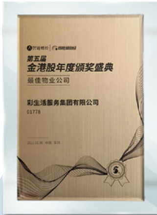
1. "Best Property Management Company" by Zhitong Finance (智通財經) and RoyalFlush Finance (同花順財經) in January 2021