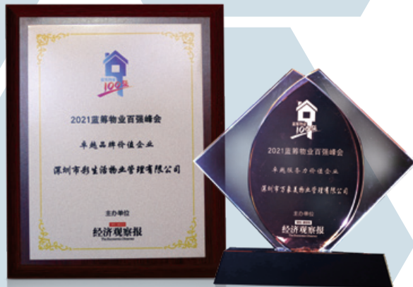
18. “Most Valuable Brands” (卓越品牌价值企业) by The Economic Observer in June 2021