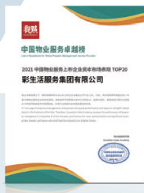
3. "2021 Top 20 Listed Property Management Companies of Outstanding Capital Market Performance in China" (2021中國物業服務上市企業資本市場表現TOP20) by Guandian Index Academy in March 2021