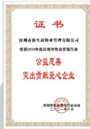
2. "Caring Enterprise with Outstanding Contribution to Charity" (公益慈善突出贡献爱心企业) by Shenzhen Property Management Association in January 2021