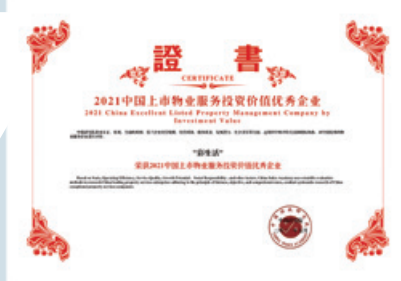
16. “2021 China Excellent Listed Property Management Company by Investment Value” by China Index Academy in May 2021