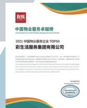
4. "2021 Top 50 Property Management Companies in China" by Guandian Index Academy in March 2021