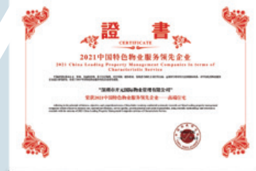
20. "2021 China Leading Property Management Companies in terms of Characteristic Service – High-end Residential Properties" by China Index Academy in April 2021