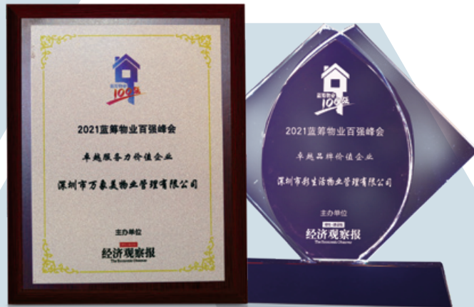
24. “Most Valuable Property Management Service Provider Brands” (卓越服务力价值企业) by The Economic Observer in June 2021