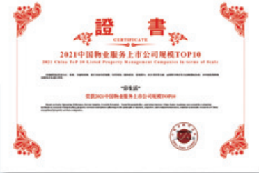
15. “2021 China Top 10 Listed Property Management Companies in terms of Scale” by China Index Academy in May 2021