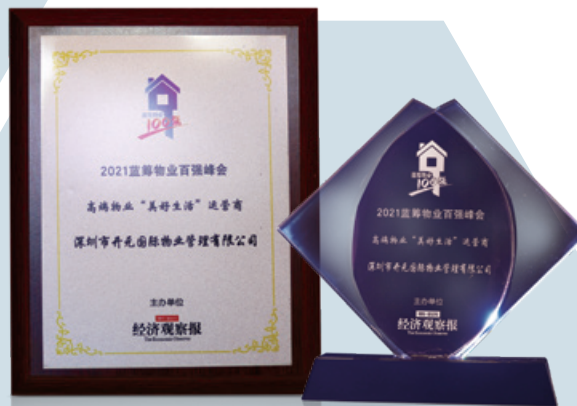
22. "High-end Property Management Service Providers" (高端物業「美好生活」運營商) by The Economic Observer in June 2021