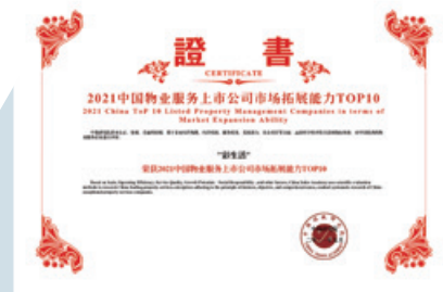
14. "2021 China Top 10 Listed Property Management Companies in terms of Market Expansion Ability" by China Index Academy in May 2021