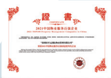
21. "2021 Top 100 China Leading Property Management Companies in terms of Customer Satisfaction" by China Index Academy in April 2021