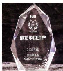
Role Model Property Developers in Terms of Product Excellence 房地產企業優秀產品力榜樣