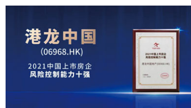
Top 10 Listed Chinese Property Developers in Terms of Risk Control Ability 中國上市房企風控能力十強