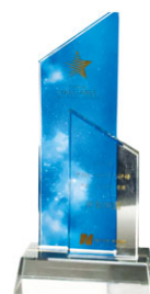
China General Ranking for Best-valued Property – Best-valued City Operators of the Year 中國價值地產總評榜 年度價值城市營運商