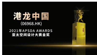
APSDA AWARDS – Gold Prize in Asia-Pacific Space Design Contest APSDA AWARDS 亞太空間設計大賽金獎