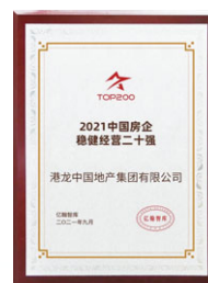
Top 20 Chinese Property Developers in Terms of Healthy Operations 中國房企穩健經營20強