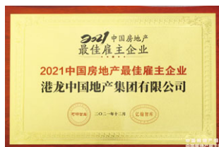
Best Employers in Chinese Property Sector 中國房地產最佳僱主企業