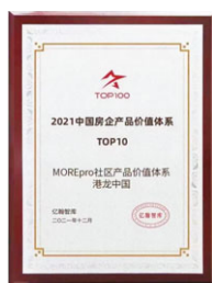
Top 10 Chinese Property Developers in Terms of Product Value Systems 中國房企產品價值體系TOP10