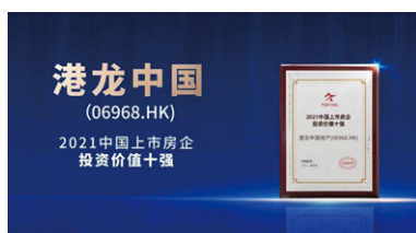
Top 10 Listed Chinese Property Developers in Terms of Investment Values 中國上市房企投資價值十強

於2021年，本集團的成就獲得市場、行業、媒體及其他持份者廣泛認可。年內，本集團在業務表現、社會責任、供應鏈管理、品牌管理、產品質量及其他領域獲得多項行業大獎。展望未來，本集團將繼續致力加強其業務實踐，為其股東、客戶及更廣泛的社會締造持續的價值。