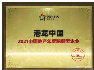
Healthy Enterprises of the Year in Chinese Property Sector 中國地產年度穩健型企業