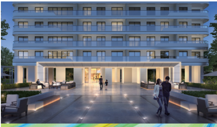
Wenzhou Future City 溫州未來社區

The year of 2021 was a year of steady development for Zhong An. Despite the turbulent market conditions and frequent occurrence of "black swans", Zhong An has always adhered to the core business philosophy of "stability" and moved forward steadily. Under the circumstance that the market environment is constantly changing, everyone in the Group is united to overcome the obstacles and difficulties. We also managed to keep pace with the times, actively embrace changes, achieve self-transformation, and successfully make a record high for the contracted sales. While maintaining economies of scale, the Group also enhanced the service quality in all aspects, and strived for high-quality development.