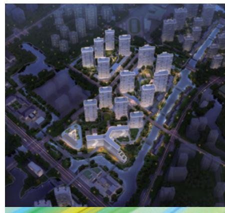
Wenzhou Future City 溫州未來社區

位於溫州市龍港未來社區，由高層及商舖組成，總佔地面積約69,369平方米，總建築面積約168,141平方米，作住宅用途。項目於2021年第四季度開工，於2021年第四季度啟動預售，預期於2024年竣工。於回顧年度，該項目預售符合預期。