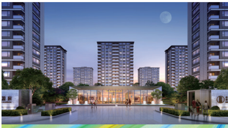
Shunyuan Mansion 順源府

It is located in Longgang Future Community, Wenzhou. It consists of high-rise buildings and shops, with a total floor area of approximately 69,369 sq.m. and a total GFA of approximately 168,141 sq.m., and is for residential use. The project commenced construction in the fourth quarter of 2021, and started the pre-sale in the fourth quarter of 2021. It is expected to be completed in 2024. The volume of pre-sales of the project during the year under review was within expectation.