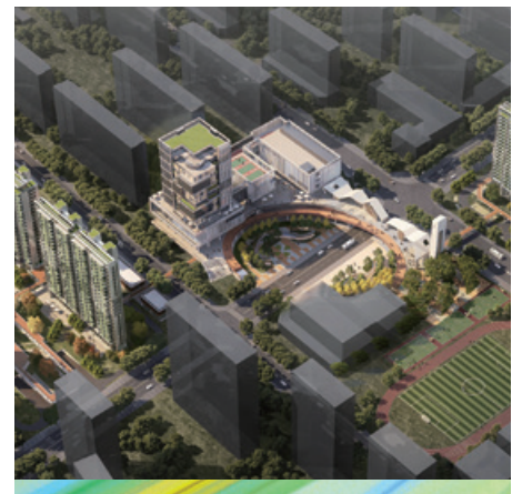
Taizhou Future City 台州未來社區

作為中國經濟最活躍、開放程度最高、創新能力最強的區域之一，長三角地區對中國經濟的影響力和帶動力不斷增強。2022年杭州亞運會的舉辦將有利推動杭州經濟、社會的全面發展，並帶動浙江省其他城市的經濟發展，推動浙江省率先實現共同富裕。本集團將繼續堅持「立足浙江，深耕長三角」的戰略佈局，充分利用自身的品牌優勢，不斷發展，不斷進步。同時，本集團還將圍繞「眾享美好生活」的核心理念，保持穩健發展的姿態，突破市場限制，走出一條為社會創造美好、為客戶實現資產增值的可持續經營發展之路。本集團也將積極遵循中央政府「三條紅線」等措施，努力保持戰略和財務穩健。