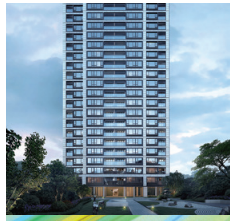
Hangzhou Lotus Mansion 杭州荷源府

2021年是眾安發展穩進的一年。雖然市場風雲變幻，「黑天鵝」頻現，眾安始終堅守「穩健」的核心經營理念，穩步前行。在市場環境不斷變化的情況下，集團上下一心，團結一致，攻堅克難。並不忘與時俱進，積極擁抱變化，努力實現自我變革，成功實現合約銷售再創歷史新高。在保持規模效益的同時，集團也全方面加強服務品質，努力向高質量發展轉變。