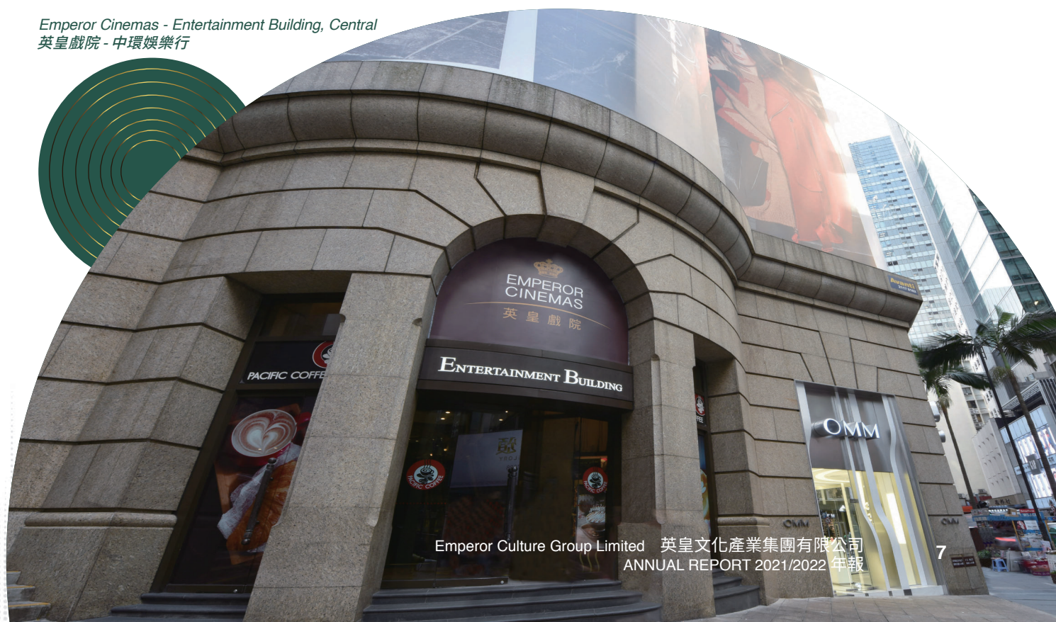
Emperor Cinemas - Entertainment Building, Central 英皇戲院 - 中環娛樂行

在本年度之收購事項完成後，於2022年6月30日，本集團共營運24間戲院，包括17間於中國內地之 英皇電影城 、香港和澳門之 英皇戲院 及馬來西亞之 Emperor Cinemas ，以及7間於中國內地之 英皇UA電影城 ，合共提供192間放映院，約25,700個坐席。所有該等戲院均位於具策略性的地點並提供優質娛樂服務。