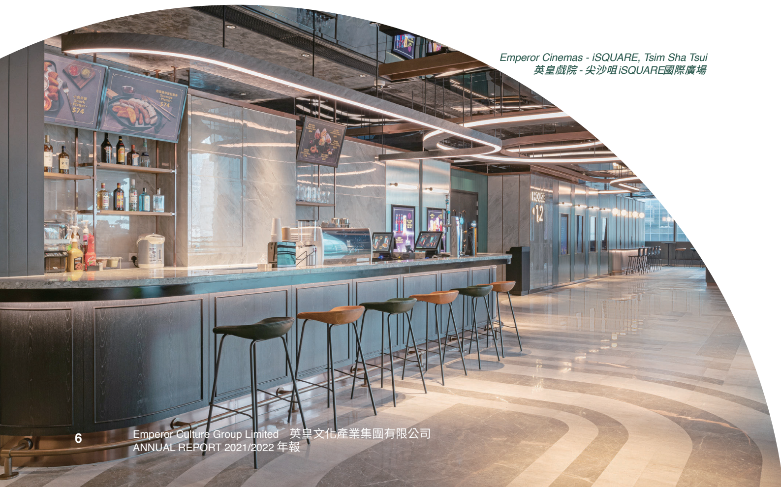
Emperor Cinemas - iSQUARE, Tsim Sha Tsui 英皇戲院 - 尖沙咀iSQUARE國際廣場

戲院營運分類之收入增加59.0%至306,700,000港元(2021年：192,900,000港元)，其中主要包括票房收入270,100,000港元(2021年：164,100,000港元)，佔戲院營運收入之88.1%(2021年：85.1%)。按地區分類劃分收入，來自中國內地及香港之收入分別為122,900,000港元(2021年：133,200,000港元)及162,800,000港元(2021年：59,500,000港元)，佔戲院營運收入之40.1%(2021年：69.0%)及53.1%(2021年：30.8%)。