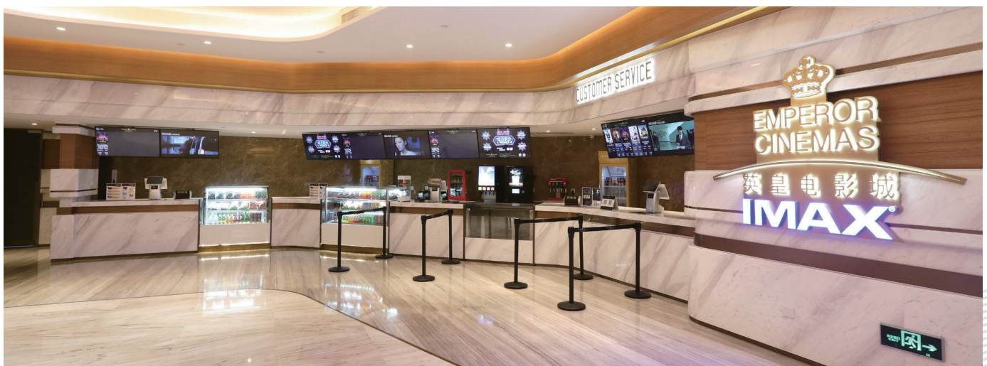
Emperor Cinemas - Emperor Group Centre, Beijing 英皇電影城 - 北京英皇集團中心

管理層一直密切監察新冠病毒疫情的發展及其對本集團目前及預期未來流動資金之影響。經考慮本集團實施的現有改善措施以及關連人士及銀行授出之可用貸款融資後，董事認為本集團將擁有充裕財務資源撥付其於未來的營運資金及應付其於可見將來的其他融資需要。