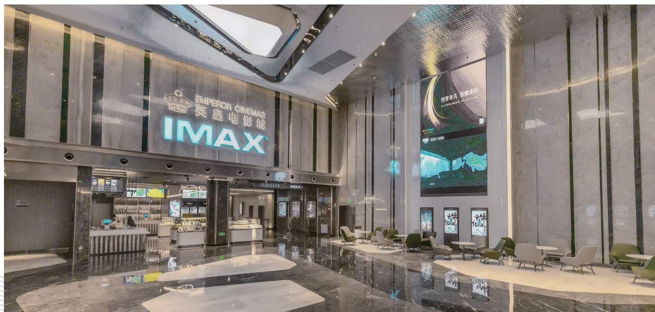
Emperor Cinemas - Shanshan Outlet Plaza, Ganzhou 英皇電影城 - 贛州杉杉奧特萊斯購物廣場