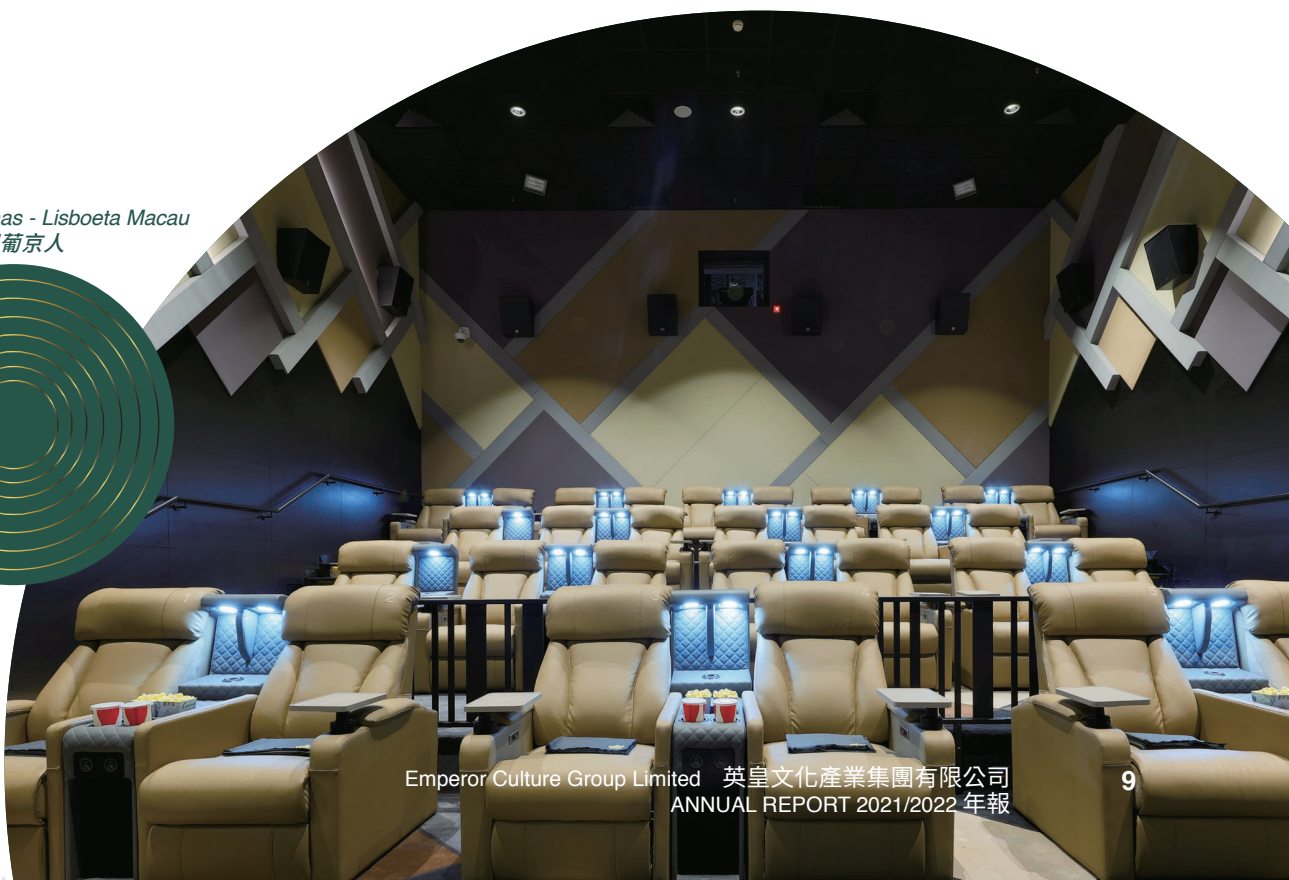
Emperor Cinemas - Lisboaeta Macau 英皇戲院 - 澳門葡京人

於2022年6月30日，本集團有若干電影製作投資，其公允價值為5,900,000港元(2021年：5,500,000港元)。