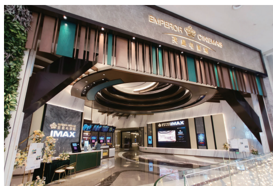
Emperor Cinemas - Ping An Finance Center, Shenzhen 英皇電影城 - 深圳平安金融中心

於2022年7月15日，本公司宣佈，英皇娛樂電影城有限公司（「 英皇UA 」，本公司間接擁有70%之附屬公司）以原訴傳票形式於香港特別行政區高等法院原訟法庭（「 高等法院 」）展開法律訴訟，以申請限制立基中國影院投資有限公司（「 UA少數股東 」，擁有30%英皇UA股權之股東，其為 英皇UA電影城 自開業的合作方）就有關根據約70,000,000港元之據稱股東貸款（「 據稱股東貸款 」）由UA少數股東送達予英皇UA日期為2022年6月30日的法定要求償債書而向英皇UA提出清盤呈請之強制令。於2022年7月26日，本公司宣佈，高等法院已作出對英皇UA有利之永久全面強制令，限制基於法定要求償債書提出上述清盤呈請。此外，UA少數股東發起了新的法庭訴訟，其按《公司（清盤及雜項條文）條例》（香港法例第32章）條文，就據稱股東貸款及（其中包括）以無力償債為由，於2022年7月22日通過向高等法院提交針對英皇UA的清盤呈請。詳情已載於本公司日期為2022年7月15日及7月26日的公告內。