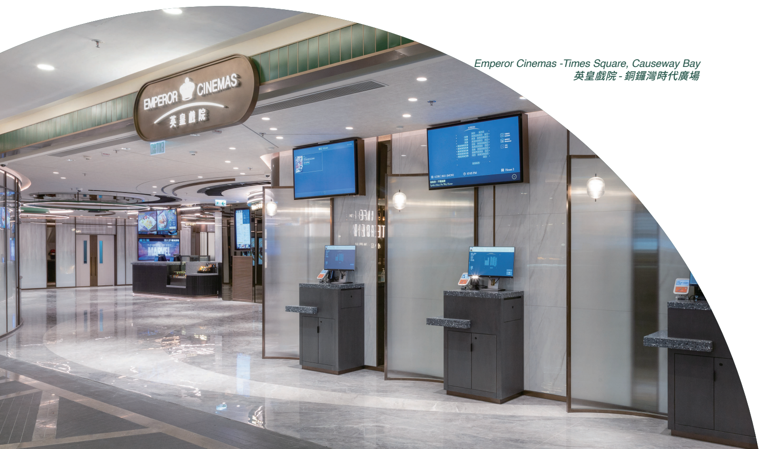
Emperor Cinemas - Times Square, Causeway Bay 英皇戲院 - 銅鑼灣時代廣場

於本年度， 英皇戲院 在2021年12月於香港時代廣場新開業。其位處銅鑼灣黃金地段，為區內最大的戲院，共佔三層，設有5間獨立放映院，當中包括2間杜比全景聲放映院。大堂經特意重新規劃及裝修後空間感大增，擴大了的等候區設有購票貴賓區，更設有擴闊了的美食專區，給予觀眾一個悠閒寫意的戲院體驗。此外，此為香港首間全部座椅均配備了手機無線充電設備的戲院。本集團透過提供最細心及重視細節的服務，致力於為觀眾提升觀賞體驗。