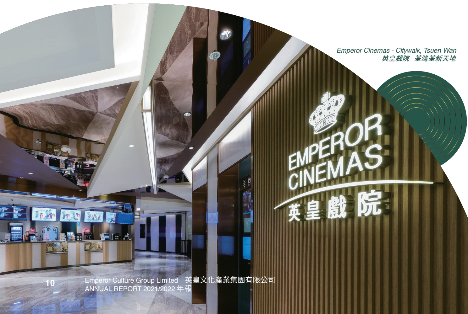
Emperor Cinemas - Citywalk, Tsuen Wan 英皇戲院 - 荃灣荃新天地

展望未來，除繼續擴闊其戲院網絡外，本集團將透過提供周到細緻的服務致力提升顧客的娛樂體驗。本集團亦將密切監察市況，並適時迅速作出反應。儘管過去兩年新冠病毒疫情在一定程度上阻礙了中國電影業的發展，但鑒於中國可支配收入的提升及生活水平的不斷改善，以及國家電影局制定的五年計劃，本集團預見前景正面。隨著其歷史悠久的 英皇 品牌，以及憑藉其戰略網絡，本集團將致力加強其核心競爭力，以把握行業從疫情復甦帶來的機遇。