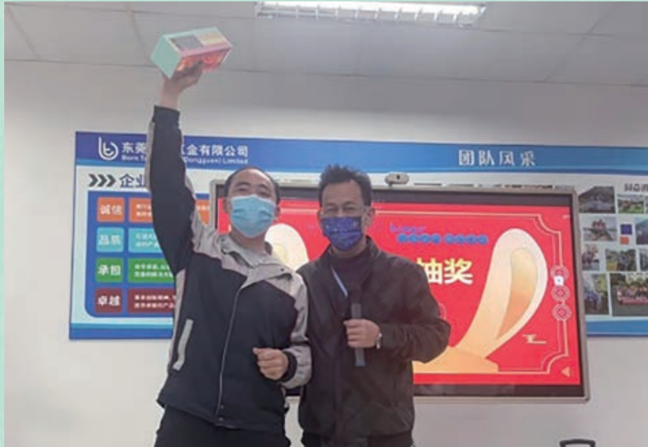
Lucky draw activity of the Group's subsidiary, Dongguan Born Talent 集團下屬東莞生才公司員工抽獎活動