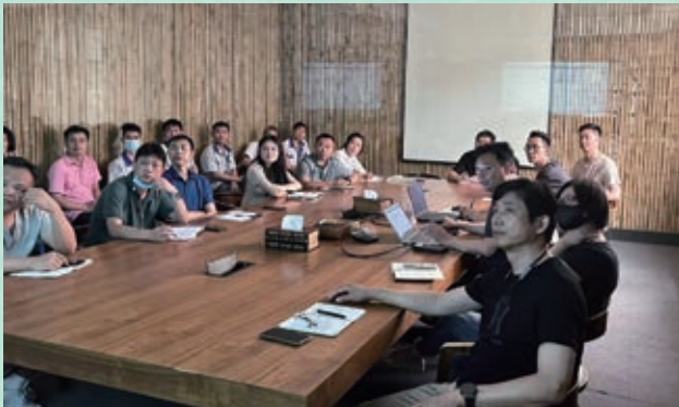
Materials management training of the Group's subsidiary, Suzhou Henge 集團下屬蘇州亨冠公司物料管理培訓