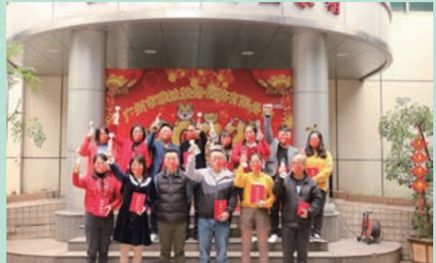
Award for outstanding staff of the Group's subsidiary, Guangzhou Artdeco 集團下屬廣州亨雅公司先進員工頒獎