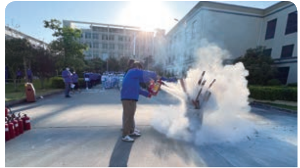
消防演習 Fire Drill