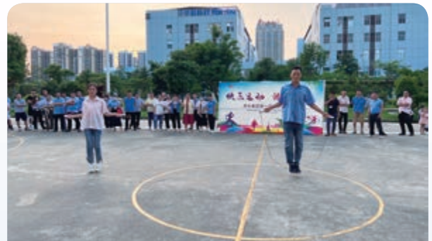
趣味運動會 Fun Games