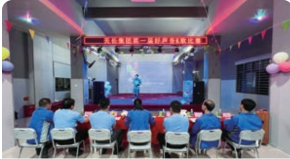
K 歌比賽 Karaoke competition