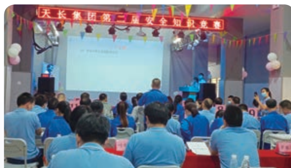
On-Job Training 在職培訓