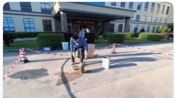
模擬化學品洩漏演習 Contingency drill on chemical