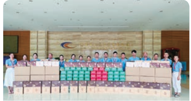
中秋節福利發放 Mid-Autumn Festival staff benefit