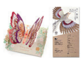
金獎 (12. 創意產品) 、金獎 (12g. 大灣區創意產品) 、 優異獎 (最佳創意印製大獎) - OPERA GIRL Gold (12. Creative Products) , Gold (12g. Creative Products) , Merit (Best Creative Printing) - OPERA GIRL