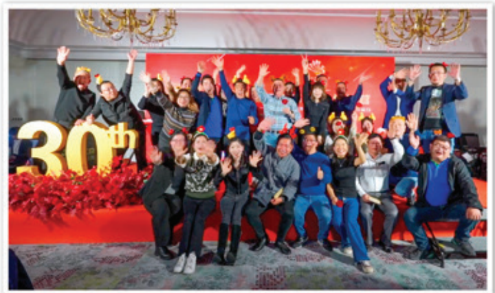
場內氣氛高漲，一片歡笑聲 The participants enjoying themselves