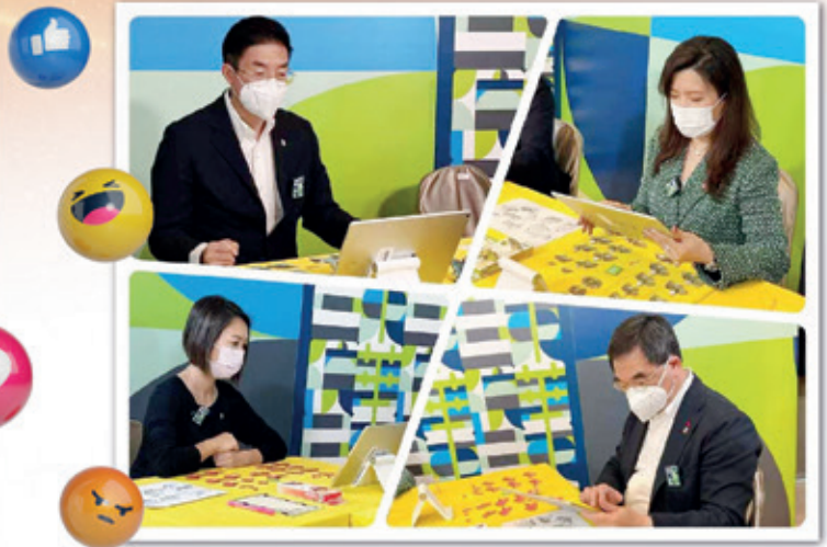
【東華·家】購買了綠團的3D恐龍拼圖，在他們的「工作與生活平衡月2022」活動中宣傳平衡工作與生活的重要性 "Tung Wah +" purchased Team Green 3D dinosaur puzzles for their event "Work-life Balance Month 2022" to promote the importance of a work-life balance.