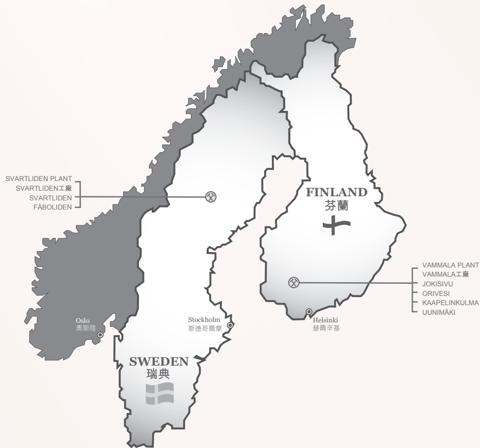
Project Location 項目地點

龍資源是一家發展成熟的黃金生產商，在瑞典及芬蘭擁有具前景的項目組合。自2000年首次進入北歐地區以來，本公司成功地將一系列露天和地下金礦投入運營，生產超過800,000盎司黃金。此乃通過本公司不斷致力於積極探索其持有的項目而實現，以保持及提高本公司的產量。