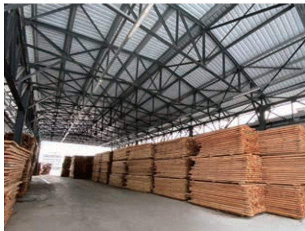
The wood lumber produced in the processing plant

The following flowchart depicts the typical operation flow of a timber supply chain business: