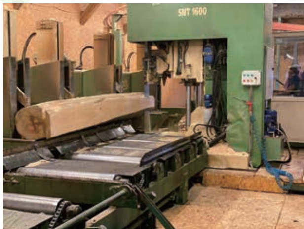
The lumber processing plant in Covasna, Romania acquired by the Group in December 2021