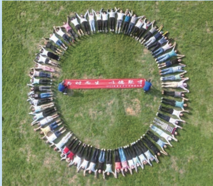
Team building activity of the Group's subsidiary, Dongguan Born Talent 集團下屬東莞生才公司員工團隊建設活動