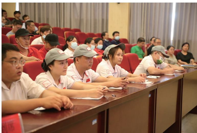
“Food Safety and Special Training for New Employees of Service Units” in Anhui Xinhua University

In addition, we have implemented a strict storage registration and equipment maintenance system for drugs and chemicals used in laboratories and infirmaries. Fire-fighting apparatuses of schools are maintained by professional personnel on a regular basis. We also provide food safety training for canteen staff, and regularly check environmental sanitation of canteens and the implementation of the food safety management system.