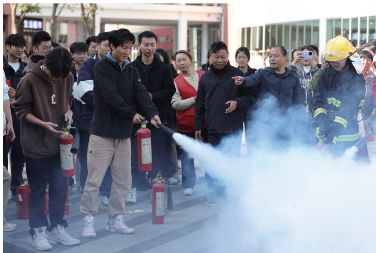
Activities in Fire Fighting Publicity Month for “Rejuvenating the Country and Serving the People through Xinhua Education” in 2023

We also carry out a number of training sessions and drills in relation to safety and fire prevention to strengthen the safety awareness of teachers and students. All of these measures represent our all-out efforts to eliminate potential safety hazards.