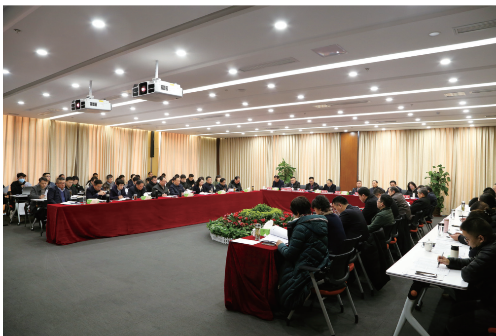
Integrity Education Provided for Directors and the Management

The Group is committed to creating an honest and equitable business environment, and advocates combating corruption, upholding integrity and fair competition among all employees. We provide all directors and employees of the Company with integrity education, and consistently reinforce the publicizing and implementation of the regulations. During the Year, with a focus on financial management, procurement management, project management, legal affairs and other aspects, the Group held special sessions and case-based training to deepen employees' understanding of anti-corruption efforts, enhance their awareness and ability of maintaining honest in their career, foster a fair, transparent and honest corporate culture, and further promote the healthy development of the Company.