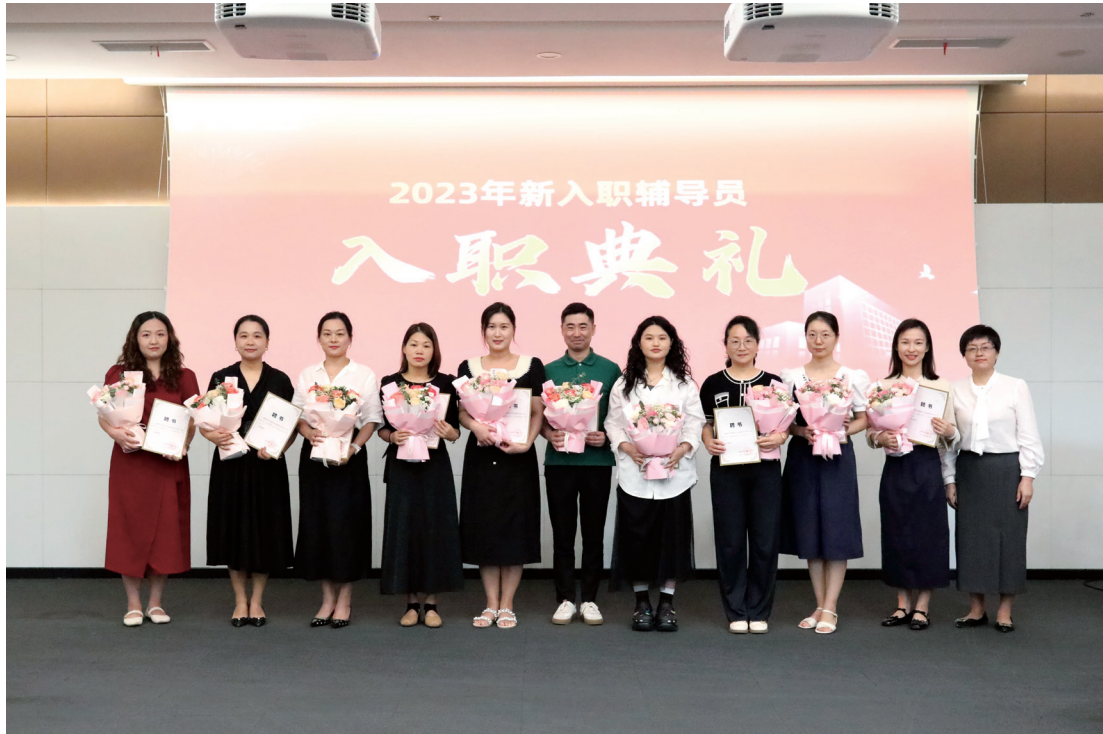
New Counselor Training and Induction Ceremony themed on “Xinhua Park Youth Navigator in Xinhua Park”

This training helped new employees obtain a thorough comprehension of their jobs, greatly facilitating their swift integration into the new work environment and accelerating their role transition and personal growth, which not only laid a strong foundation for their individual career development, but also made a significant contribution to talent cultivation and team construction within the schools.