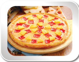
夏威夷风情比萨 Hawaiian Style Pizza