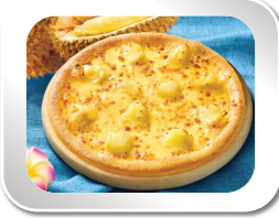
果肉榴蓮比萨 Durian Pizza