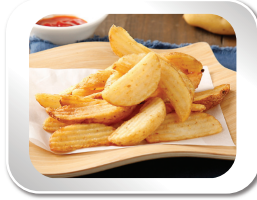
黄金薯角 Potato Wedges