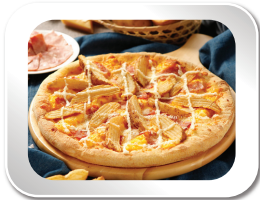
美国风情土豆培根比萨 Potato Bacon Pizza