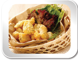
酥香嫩鱼块 Fish Bites