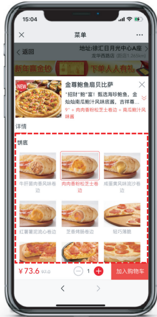
Choosing from multiple crust options