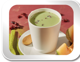
哈密瓜抹茶奶绿饮 Hami Melon Matcha Milk Green Tea