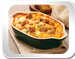
咖喱牛腩焗饭 Curry Beef Rice