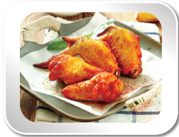
烤翅 Chicken Wings