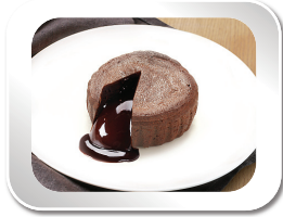
巧克力熔浆蛋糕 Lava cake