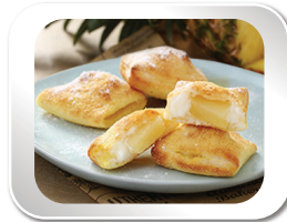
香甜菠萝芝士派 Pineapple Pie