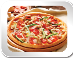
豪华尊享比萨 Deluxe Pizza