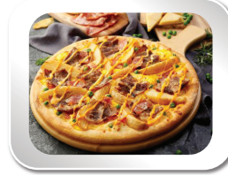
照烧风味牛肉土豆比萨 Teriyaki Flavored Beef Potato Pizza