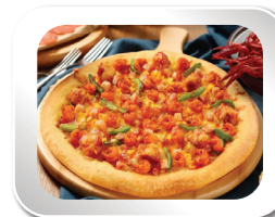
小龙虾酥香嫩鸡比萨 Crayfish and Chicken Pizza