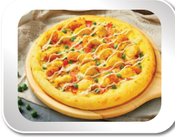
金沙咸蛋黃嫩鸡比萨 Salted Egg and Chicken Pizza