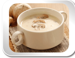
奶油蘑菇汤 Creamy Mushroom Soup