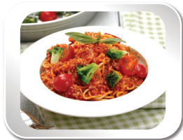
意大利风情肉酱面 Spaghetti Bolognese