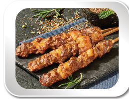
滋滋烤牛肉串 Roasted Beef Skewer