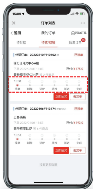
In-kitchen order tracking