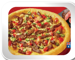
澳洲和牛芝香菌菇比萨 Australian Wagyu Beef Mushroom Pizza