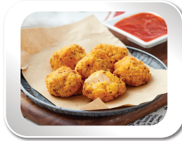
美乐嫩汁鸡块 Boneless Chicken