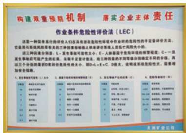
Method of Risk Assessment for Operation Conditions in Mines 於礦山的作業條件危險評價辦法

The Group has equipped its factory and head office with all the required safety equipment and facilities, and has passed all the governmental safety inspections.