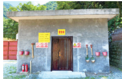
Safety facility outside explosive storage 雷管庫外的安全設備