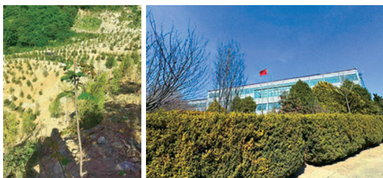
In the year 2024, Taizhou Mining actively plants trees in office region 於二零二四年度，太洲礦業積極在辦公樓園區種植樹木