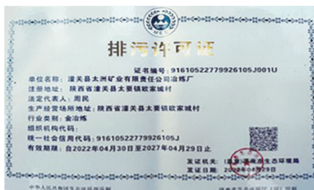
Taizhou Mining has obtained a pollution discharge permit 太洲礦業已取得排污許可證書

本集團在廢水控制及循環再用方面投入大量生產成本以符合《污水綜合排放標準》。廢水內僅包含少量有害物質，沒有發現不符合《污水綜合排放標準》。