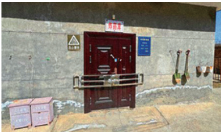
Safety facility outside warehouse storing detonators 炸藥庫外的安全設備

本集團使用炸藥開採金礦物，並嚴格遵守與中國標準貫徹一致的炸藥使用規則及法規。本集團設有經安全機構及控制物資的地方公安機關批准並根據其規定標準設計的專門、專用及隔離的炸藥庫。雷管及炸藥存放於兩個獨立的庫內，彼此之間存有安全距離。該等庫房所在的院落完全被高牆、金屬門及24小時監控攝像頭護衛。兩間炸藥庫均各有兩把鎖、鎖匙由兩名獨立僱員（一名管理人員及一名安全人員）保管。僅於該兩名人員（鎖匙保管人）同時出現方能完全打開全部門鎖，方可取得雷管及／或炸藥。存儲設施由管理層以及安全及公安機關定期檢查，以確保始終合規。使用炸藥後，本集團將使用檢測設備測量空氣殘餘物數量，待空氣符合標準後方會安排僱員進入金礦。