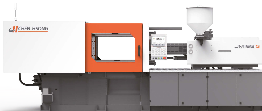
捷霸G系列伺服驅動注塑機 JETMASTER G Series Servo Drive Injection Moulding Machine

As the Group has been engaged in international markets since time memorial and retains robust sales networks or direct-owned subsidiaries in many countries, thus the Group managed to take advantage of and gain material growth from the above-mentioned growth markets. On the other hand, such gains were unfortunately not adequate to fully compensate for structural declines in the Group’s other main international markets. As a result, the Group still registered a 10% decline in other overseas countries turnover to HK$522 million (2023: HK$579 million).