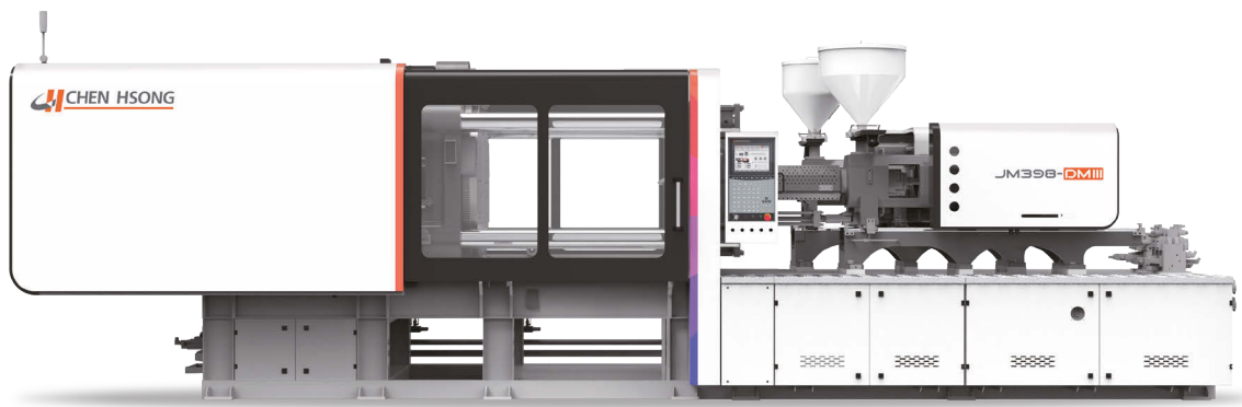
捷霸DMIII第三代多物料伺服驅動注塑機 JETMASTER DMIII Third Generational Multi-material Servo Drive Injection Moulding Machine

Last, but not least, the Group also launched the new “G” series of general-purpose injection moulding machines which completed much-needed coverage of the mid-to-low end range of the market during this financial year.