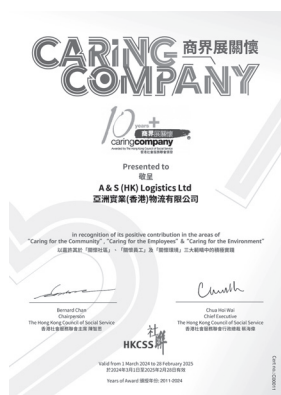
Figure 1: Certificate from Caring Company

During the Reporting Period, the Group has joined the Caring Company Scheme and granted the "10 Years Caring Company" logo by The Hong Kong Council of Social Service (see figure 1).