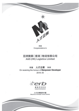
Figure 2: Certificate from the Manpower Developer Award Scheme

To contribute to the wellbeing of the community, the Group made donations to the Senior Citizen Home Safety Association to support the provision of free 24-hour emergency support and care services for those in need.