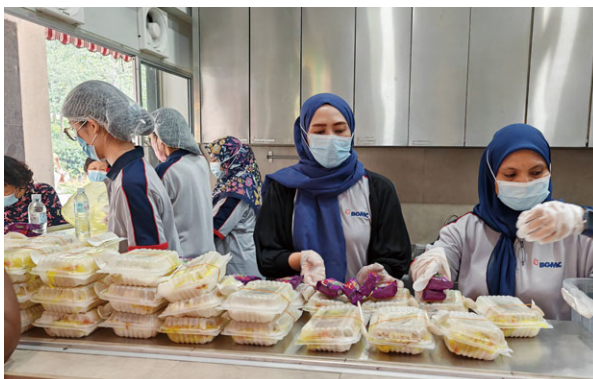
Packing food for distribution 用於分發之包裝食品

We collaborated with KSK (that has been serving homeless and marginalised communities in Malaysia for over 15 years) and volunteered to distribute packed meals to homeless that are registered with KSK. On 1 November 2023, we joined KSK to distribute packed meals to 100 individuals in need. Through our collective efforts, we were able to provide nourishment and support to those in need, offering a glimmer of hope during challenging times.