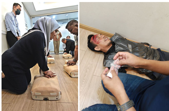
1-day Training on 'Learn Lifesaving Skills' 為期一天的「學習救生技能」培訓

Essential in talent management, the Group motivates employees with ethical practices and social responsibility, building trust, fostering loyalty, and reducing turnover, creating a strategic advantage in talent acquisition and retention. Beyond typical company functions, positive impacts on stakeholders and communities enhance employee engagement, providing purpose beyond job roles and improving overall business performance.