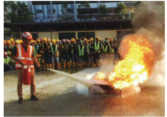
The Grand ToolBox awareness on “How to use Fire Extinguisher” at project site on 22 February 2024.

於2024年2月23日在項目現場有關「安全帶及高空作業」的Grand ToolBox awareness活動。