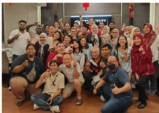
Chinese New Year 2024 dinner gathering at Unique Seafood Restaurant, Petaling Jaya on 2 February 2024 2024年2月2日在八打靈再也Unique Seafood Restaurant舉行的2024年農曆新年聚餐

作為人才管理的關鍵，本集團以道德實踐和社會責任激勵員工，建立信任、培養忠誠度和減少流失，在人才獲取及挽留方面創造戰略優勢。除一般公司職能外，對利益相關方及社區的積極影響提高了員工參與度，提供了工作角色以外的目標，並提升總體業務表現。