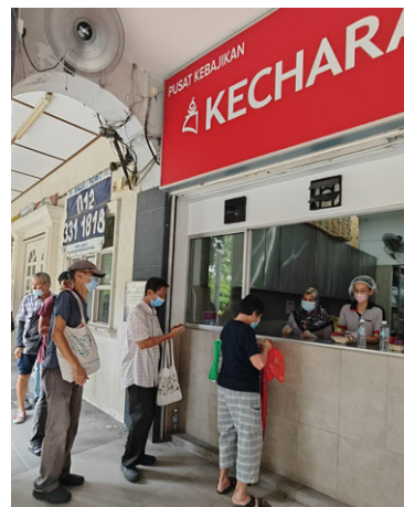
Distributing packed meals 分發盒飯

我們與KSK攜手合作，KSK已經為馬來西亞的無家可歸者和邊緣社區服務超過15年，並主動向在KSK登記的無家可歸者分發盒飯。2023年11月1日，我們加入KSK，為100名有需要的人士分發盒飯。通過共同努力，我們能夠為有需要的人士提供營養及支援，在充滿挑戰的時期帶去一線希望。