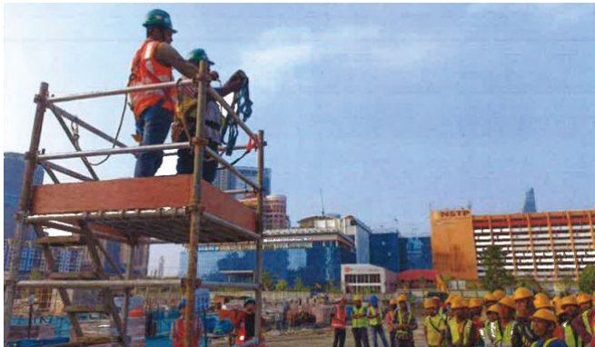
The Grand ToolBox awareness on “Safety Harness and Working at Height” at project site on 23 February 2024.

During the Year, the Group’s ESH Division has initiated and organized several Grand ToolBox Awareness training on specific topic such as “Safety Harness and Working at Height”, “How to use Fire Extinguisher” and etc.