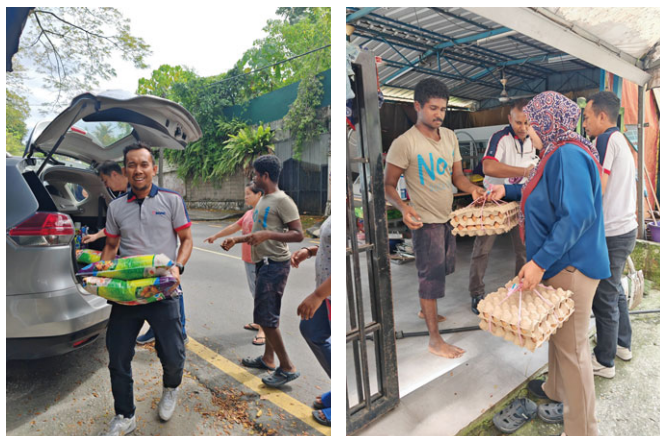
Some of the donated items 部分捐贈物品

As part of our continuous outreach initiative in the Group's CSR program, we donated daily dry food products such as flour, milk, rice, cooking oil and other essentials to Stepping Stones Living Centre located at Taman Seputeh, Kuala Lumpur. Established in November 1998, the centre is a home for underprivileged children, women, single mothers as well as the elderly.