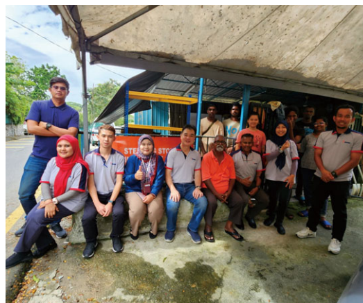
Group photo capturing the involvement of our team 拍攝我們團隊參與的合影

作為本集團CSR計劃持續外展活動的其中一環，我們向位於吉隆坡Taman Seputeh的Stepping Stones Living Centre捐贈日常乾糧產品，如麵粉、牛奶、大米、食用油和其他必需品。於1998年11月成立，該中心是貧困兒童、婦女、單身母親及長者的住所。