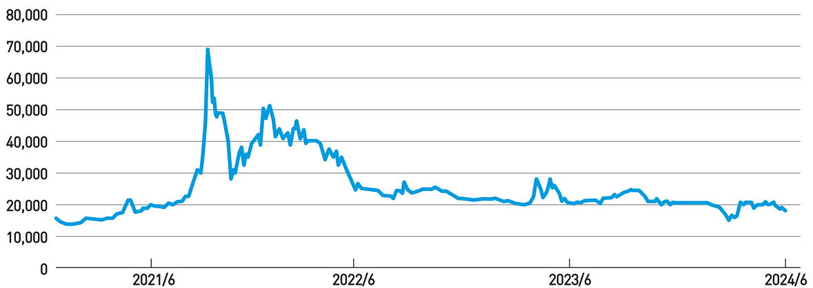
中國金屬鎂出廠價格（元／噸） Factory price of magnesium metal in China (RMB/ton)

In the first half of 2024, the price of magnesium metal continued to decline and remained at a low level, affected by the poor domestic and international economic environment, weak downstream demand, supply-demand imbalance, easing costs, and decreased exports. The average price of magnesium ingots in China in the first half of 2024 was RMB20,536.58/ton, down 14.14% year-on-year compared to the first half of 2023, and down 12.57% compared to the second half of 2023. The magnesium smelting end was in a loss-making situation in the industry as a whole.