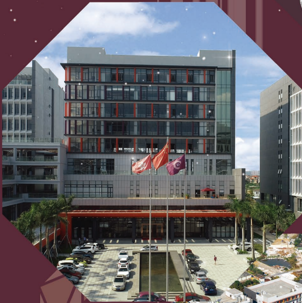
保發集團大廈 PERFECT TOWER