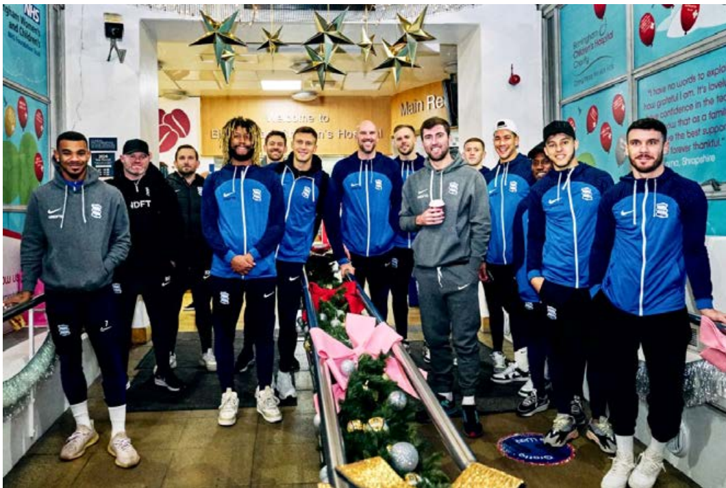
Members of the Men's First Team toured the United Kingdom's leading specialist paediatric centre in December 2023. 男子足球一隊成員於2023年12月參觀了英國頂尖的兒科專科中心。

BCFC基金會為合作學校提供全職足球學院教練，以加強對青少年的教育。有關課程包括導師指導、算術及識字支援、體能教育、足球訓練、針對性介入及教牧關懷。導師指導是整個計劃的關鍵部分，而BCFC向年輕人展示出只要用心，彼等均可成就遠大的夢想、實現高遠的目標以及克服重重的障礙；同時亦協助年輕人訂立目標，建立個人發展計劃。