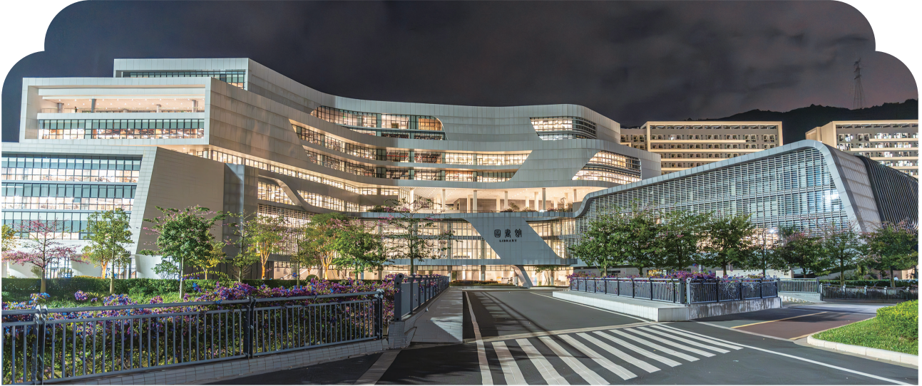
Library Zhaoqing School