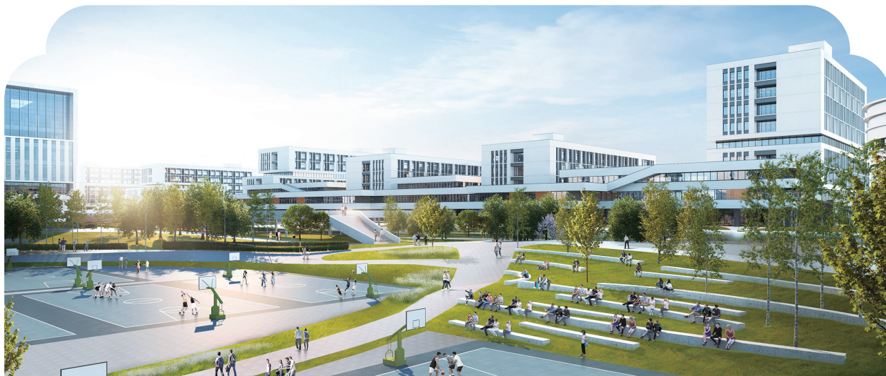
Effect image of the sports park of the new campus of Shandong School

The Co-Chairmen's Statement on pages 5 to 9 of this annual report constitutes part of this Management Discussion and Analysis.