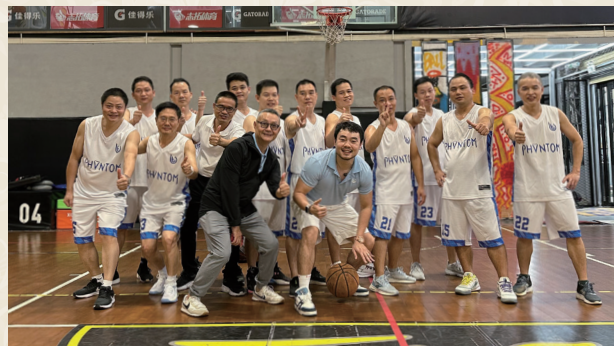
Activity of the Group's subsidiary, Dongguan Born Talent 集團下屬東莞生才公司活動