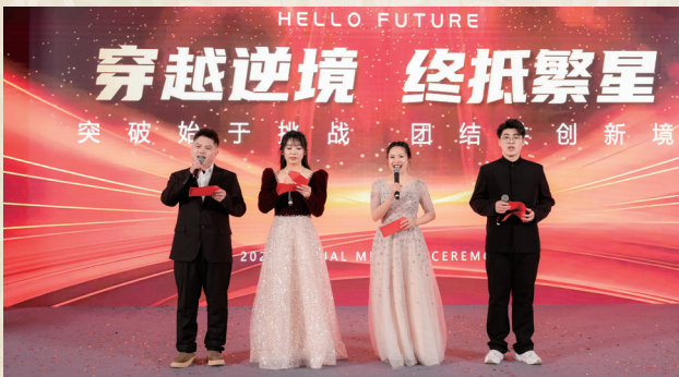
Activity of the Group's subsidiary, Suzhou Henge 集團下屬蘇州亨冠公司活動