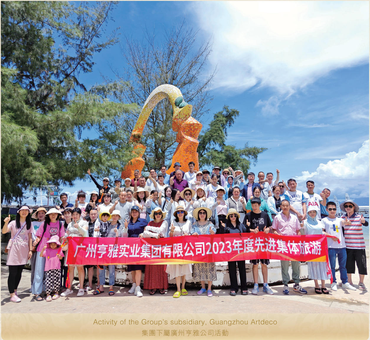
Activity of the Group's subsidiary, Guangzhou Artdeco 集團下屬廣州亨雅公司活動